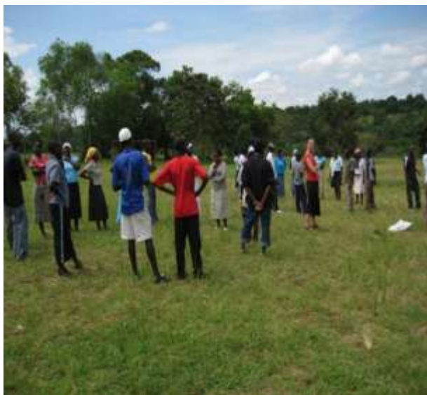
Group session with young people